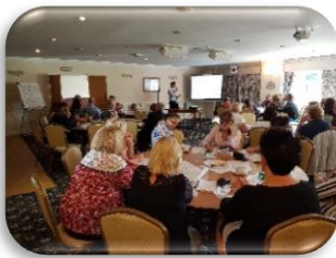
Care Navigation workshop 1, Caerphilly NCNs

Care Navigation is being rolled out across NCN Clusters in the Aneurin Bevan University Health Board area. Patients often ask to see a GP for issues which do not necessarily need a medical response, and could be helped by other services e.g. within the Third Sector. Care Navigation helps GP receptionists to discuss alternative support options with patients, therefore creating greater capacity for GPs.